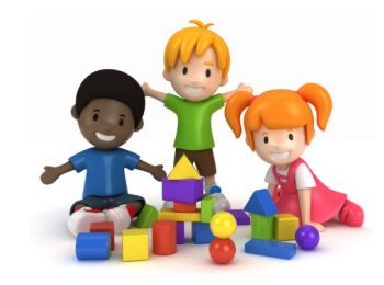
Grade 1 - 5 Registrations will occur after Easter.

The Scholastic Book Fair will be set up from February 12-16 in the NS Learning Commons! It will be open from 8:30am-4:30pm Monday to Thursday, as well as during Literacy Night on Thursday, February 15 from 6-7pm and Friday, February 16 from 8:30am-1:30pm!